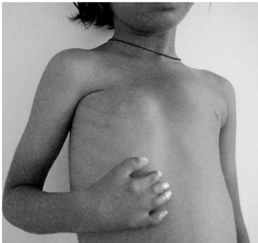
Fig. 1: Photograph showing absence of right nipple and right-sided subcutaneous tissue with right-sided acromelia with syndactyly involving middle-three fingers

A nine-year old girl presented with congenital deformity of right-sided chest and right hand. She was first child of non-consanguineous marriage with normal development till age. Her sister was normal. On examination, right sided chest muscle and nipple were absent with acromelia and cutaneous syndactyly involving middle three fingers of the same side. Scapula of same side was small. No other anomaly